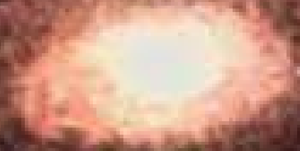
M63, Sunflower Galaxy, 8/4/04