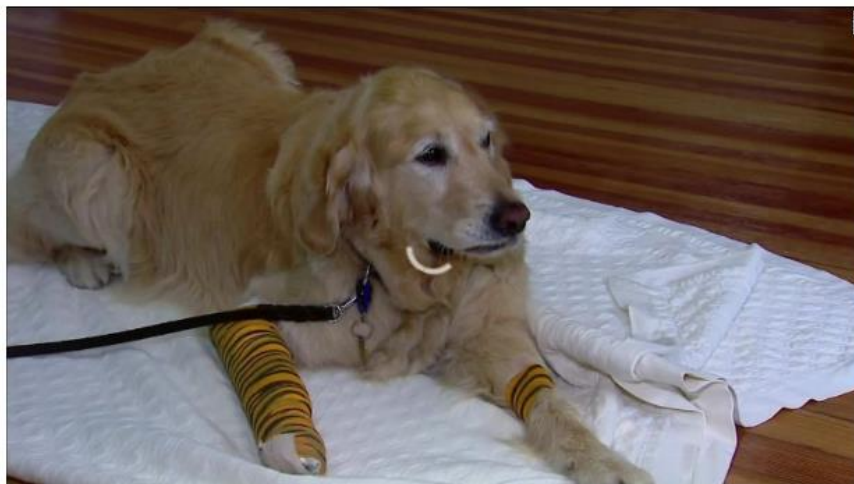
Figo to the rescue: Service dog saves owner 01:48